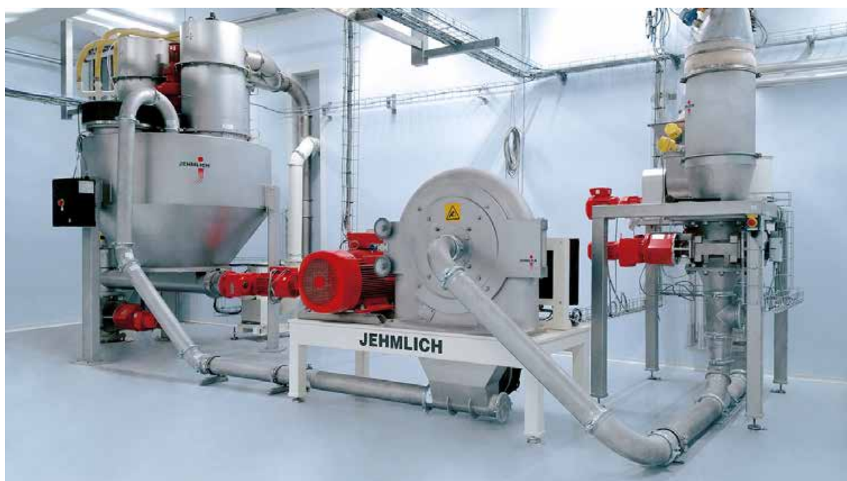
Example: REKORD Sugar Grinding system with stirred icing sugar buffer container, net volume 1.500 liters